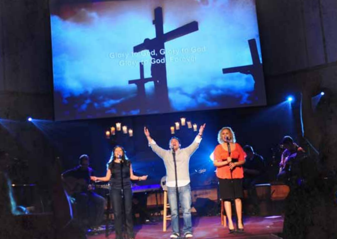
Above: Vibrant music is a key component of a Younger Generation Church worship experience. Below: A prayer of dedication and healing for some of the YG Church family.