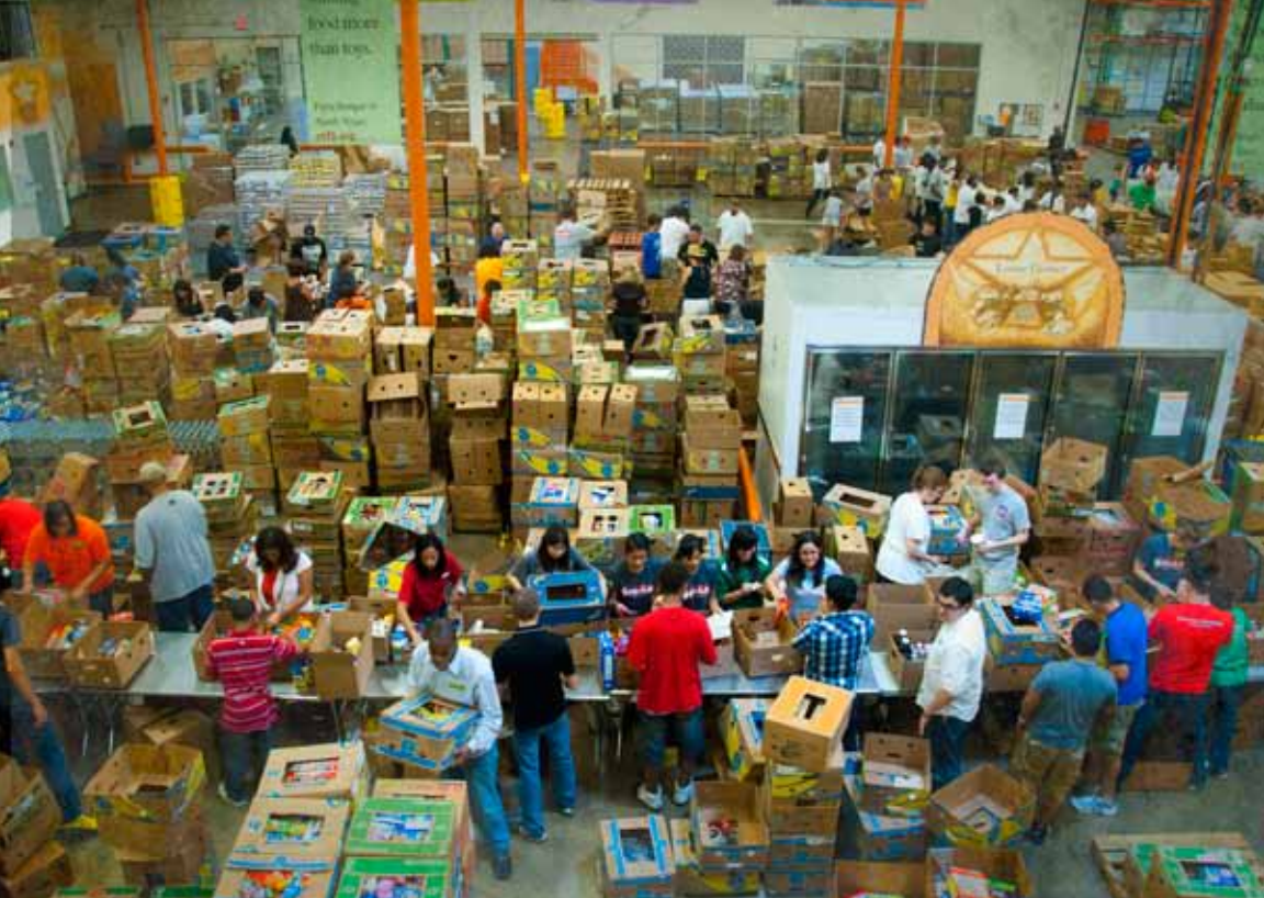
Above: YG members and friends help to pack boxes for hungry families at the North Texas Food Bank. Below: YG regularly ministers to the homeless in Fort Worth's Unity Park.